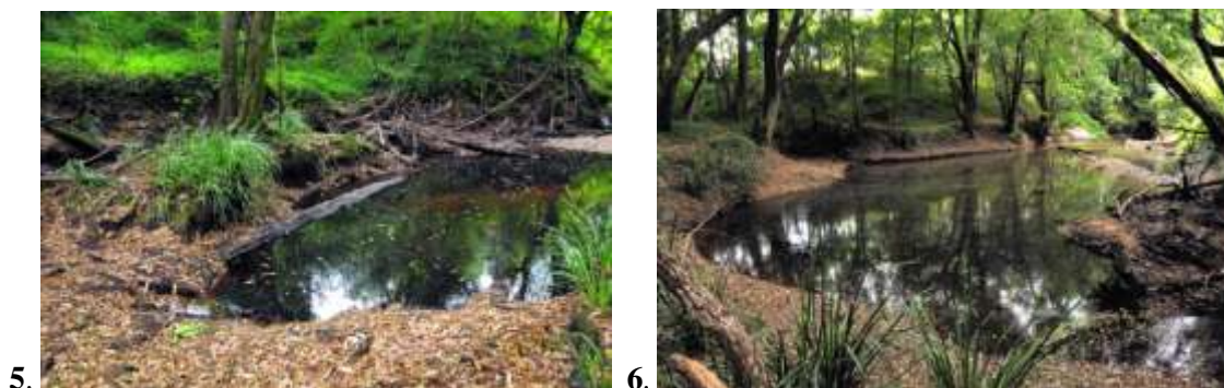
Site M3 , viewed downstream (5); viewed upstream (6), taken February, 2014.