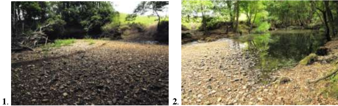
Site M1 , viewed downstream stream (1); viewed upstream (2), taken February, 2014.

The presence of cattle in Site M1 was again having an obvious impacting both on the banks/riparian zone and the river bed as well as significantly adding to the nutrient loads in the water. The banks were damaged and degraded with cattle tracks which are particularly noticeable in Photo 1. The surface of the pool and riffle beds contained large amounts of fine particulate matter from the cattle defecating in the stream.